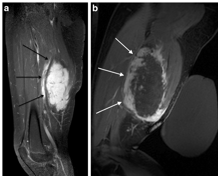
Fig. 3 Sagittal spoiled gradient echo fat-saturated postcontrast images a before and b immediately following MRgFUS treatment in a 14-year-old girl. The pretreatment image clearly demonstrates the sciatic nerve coursing through the posterior aspect of the mass ( black arrows ). Post-treatment plane demonstrates large non-perfused volume with relative sparing of the region immediately adjacent to the nerve ( white arrows )

The second two treatments also highlight the importance of energy selection for desmoid tumors. The major focused ultrasound systems used to treat desmoid tumors currently rely on software parameters tailored for treatment of uterine fibroids, and while these tumors share certain fibrosis promoting features in common, differences in vascularity and specific monoclonal proliferation (smooth muscle cells in the case of fibroids versus fibroblasts in the case of desmoids) contribute to differential acoustic properties which might require